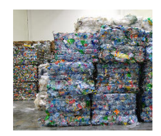
Particularly suitable for cardboard, plastic film and PET bottles