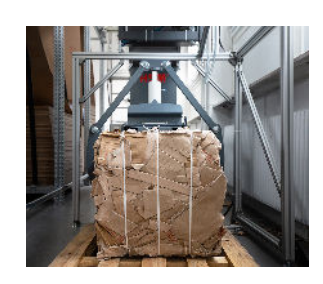
Available as an option with manual strapping

Loading aperture of 1000 mm suitable for larger material pieces and higher throughput rates